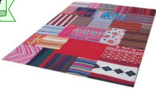
Sharda Exports (India) Location: Hall of Glamour (Booth: 3F-G04)