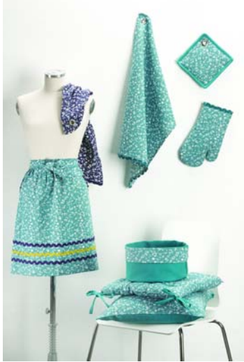
Consolidate Merchandise Associates (Belgium) Location: Hall of Glamour (Booth:3F-G05)