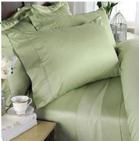
Xuzhou Yonghe Home Textile Factory (Chinese Mainland) Location: Baby & Bedroom Textiles (Booth no.: 3F-G18)