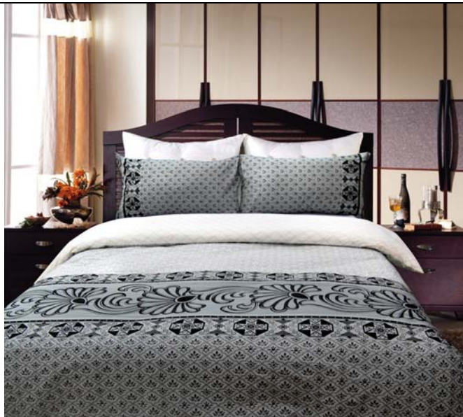
J-Tex (HK) Co Ltd (Hong Kong) Location: Baby & Bedroom Textiles (Booth: 3G-B16)