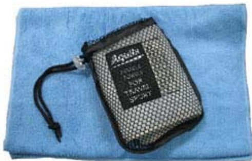
Aquila Manufacturing Limited (Hong Kong) Location: Bathroom & Kitchen Textiles (Booth no: 3F-B03)